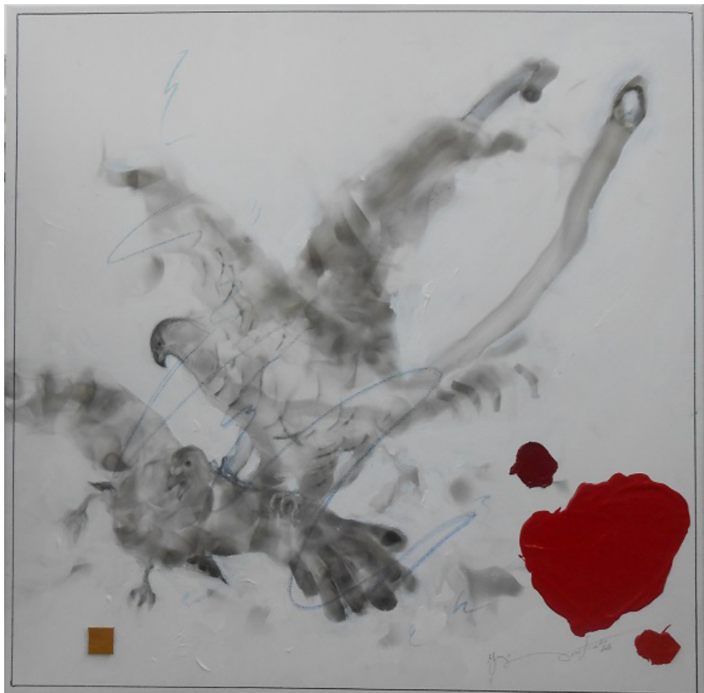
Imitation of Nature, a Human Right (2016), fumagine, acrilico e pastello su tela, cm 70x70