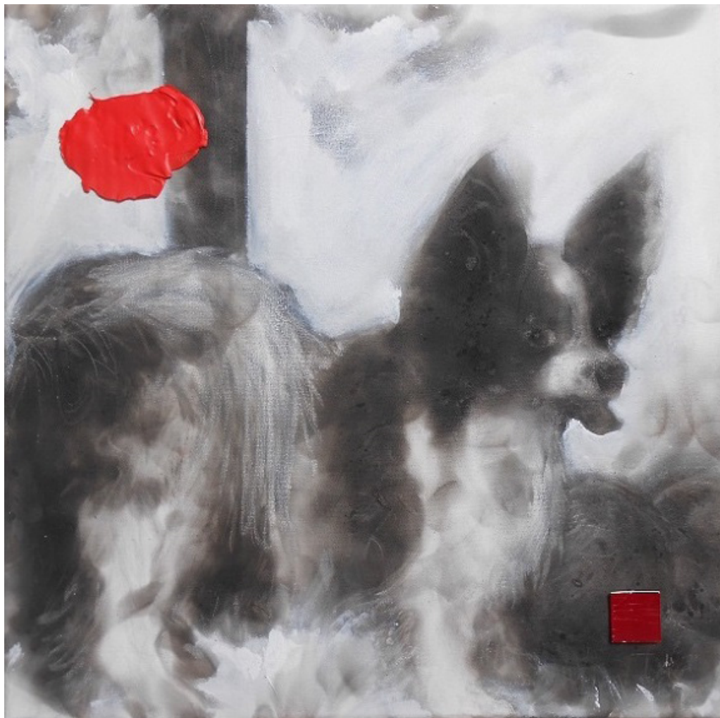
My Habitat (Noart). Between You and Me (2005), fumagine e acrilico su tela, cm 70x70