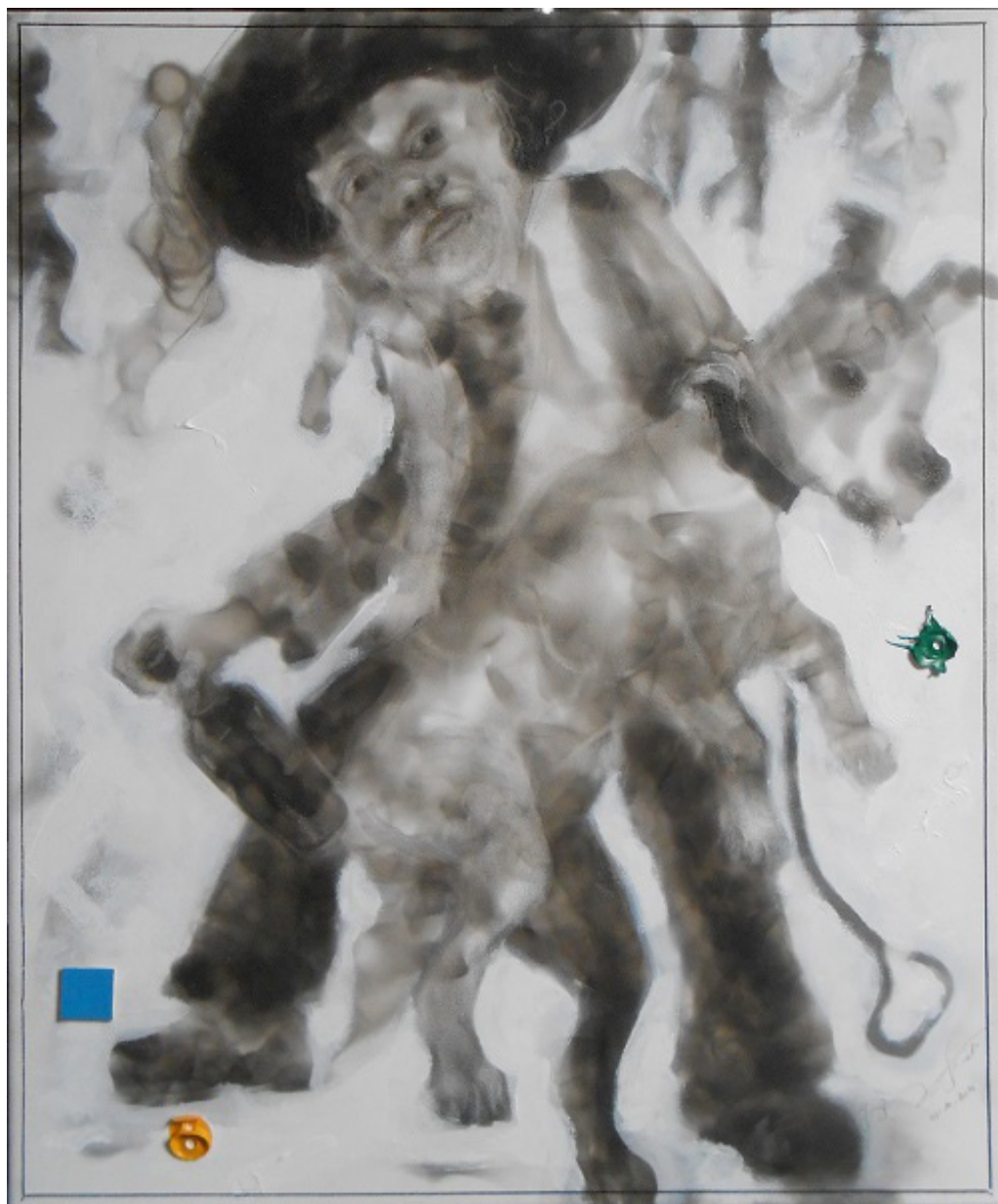
Passage (2016), fumagine e acrilico su tela, cm 50x60