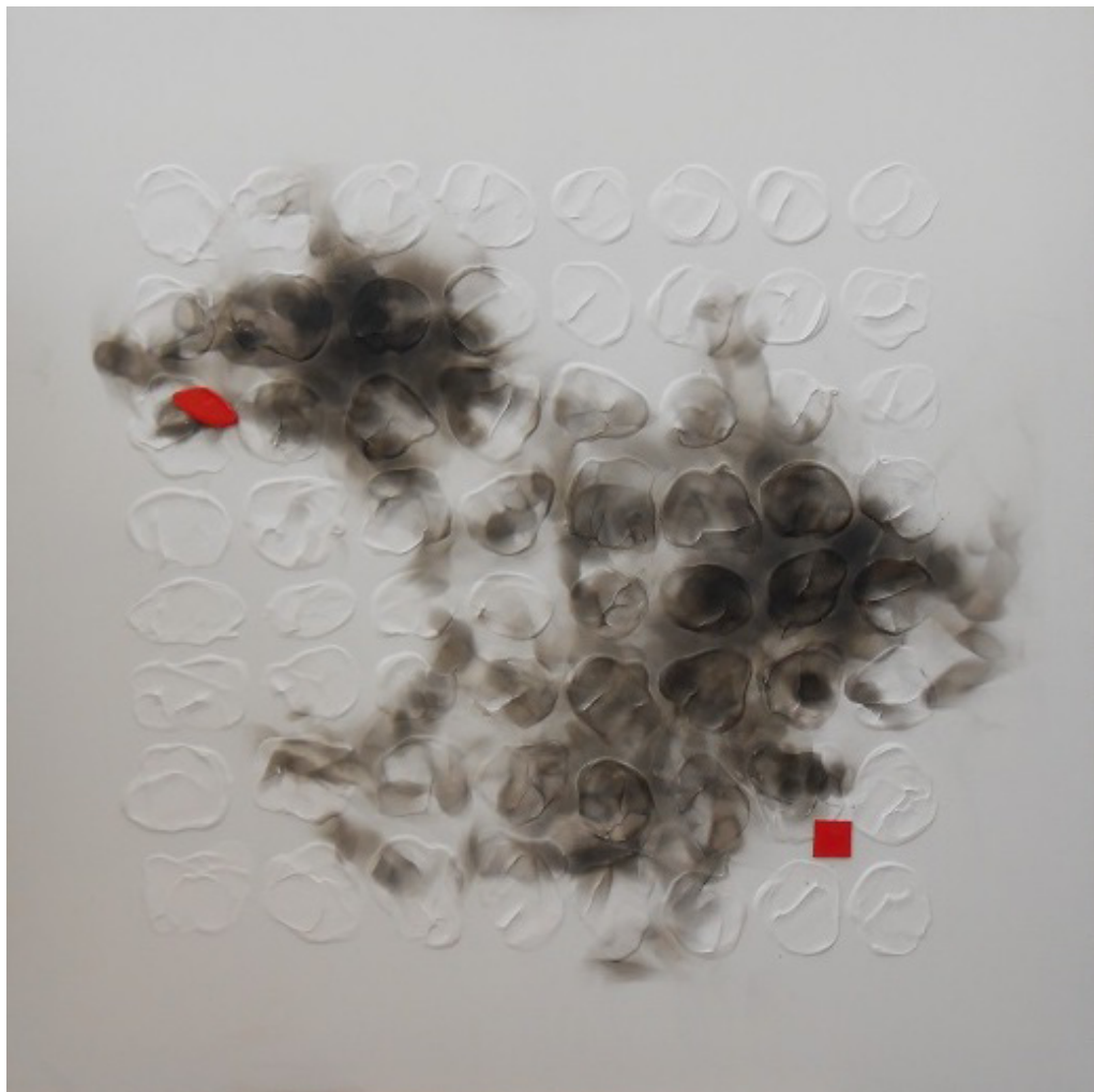
My Habitat (Noart). Always Until Eternity (2015), fumagine e acrilico su tela, cm 70x70