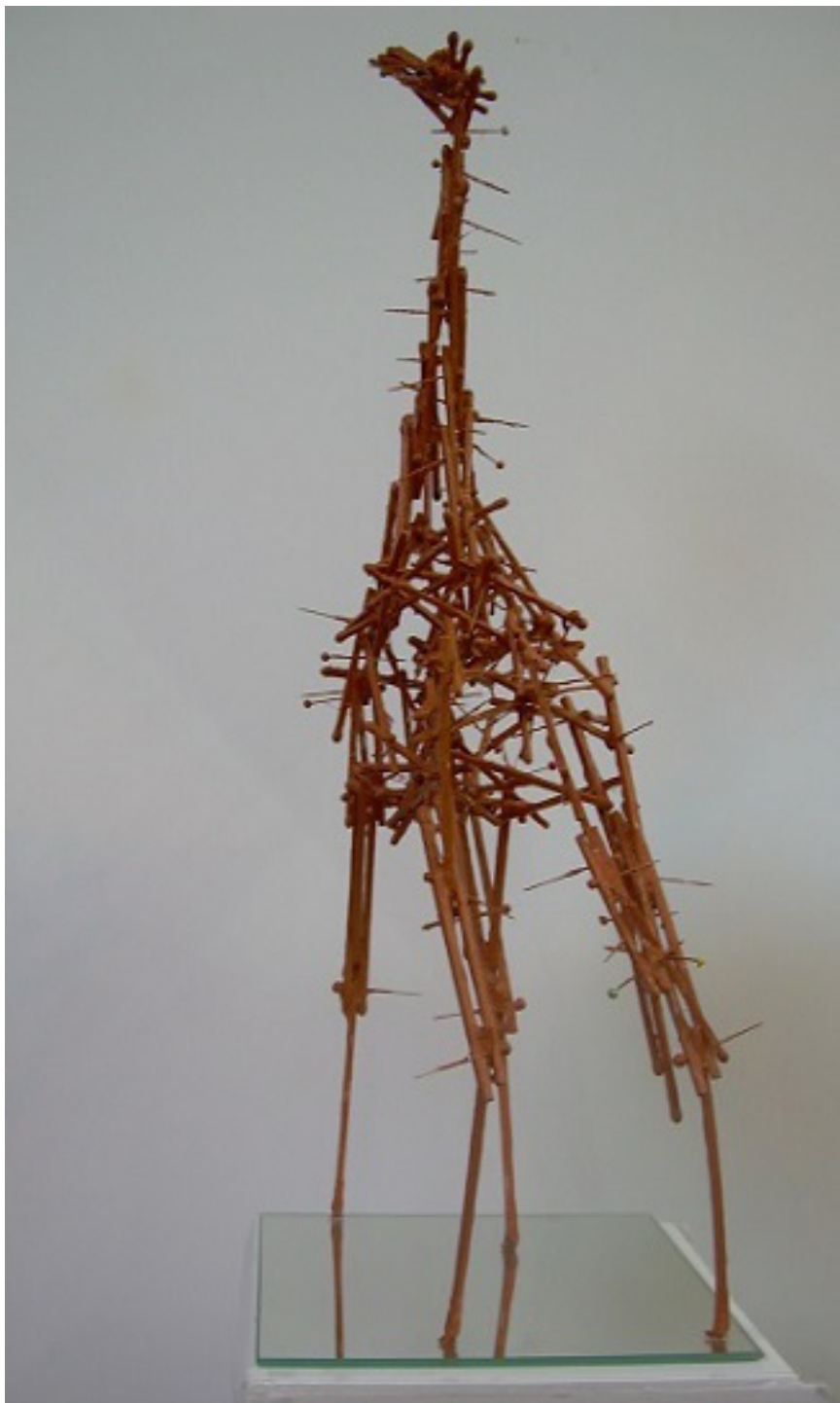
Giraf (Giraffa) (2013), vernice, fiammiferi, cm 13x12x39