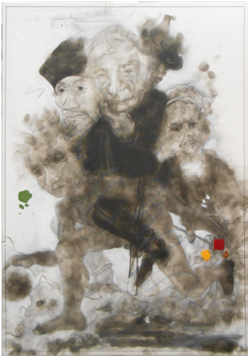
Praise of Folly (2016), fumagine e acrilico su tela, cm 70x100