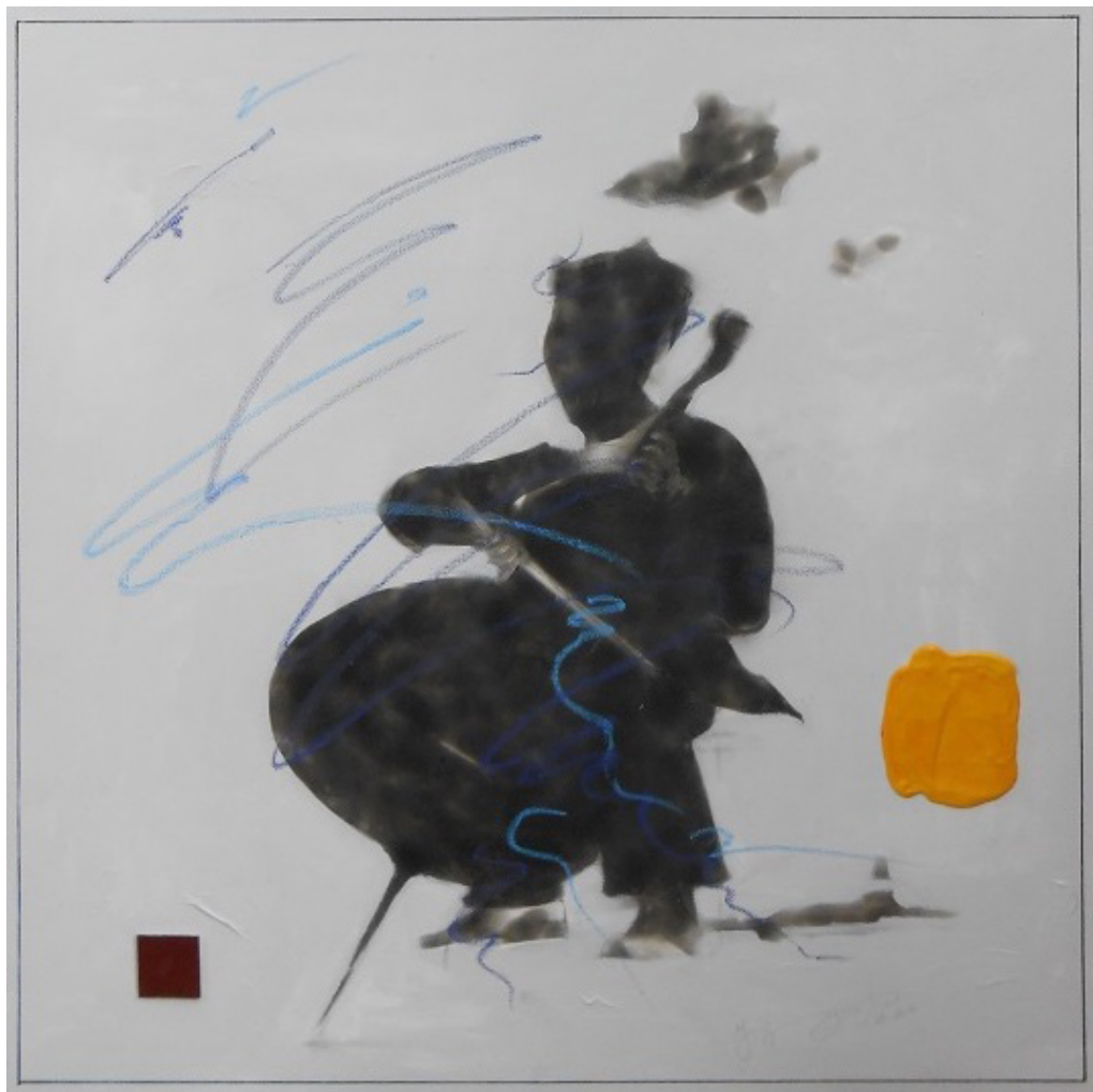
The Cellist (2016), fumagine, acrilico e pastello su tela, cm 70x70