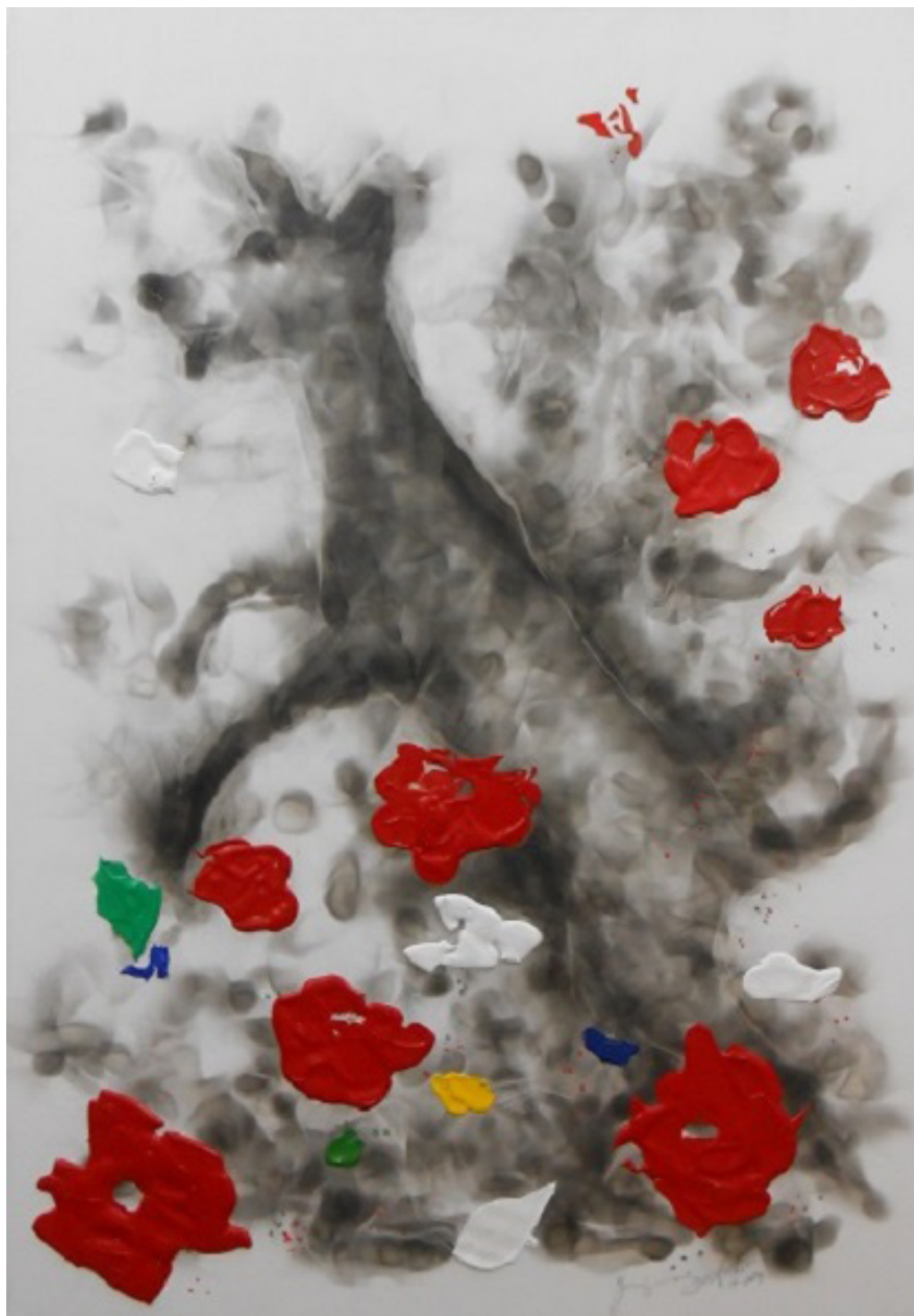
Moving in a Colored Battle Field (2014), fumagine e acrilico su tela, cm 70x100