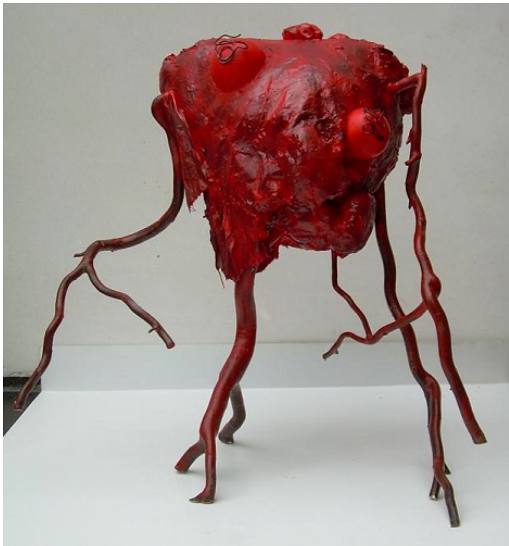
Als een kip zonder kop (Come un pollo senza testa) (2007), rami, poliuretano espanso, polistirolo, DNA, cm 54x37x58