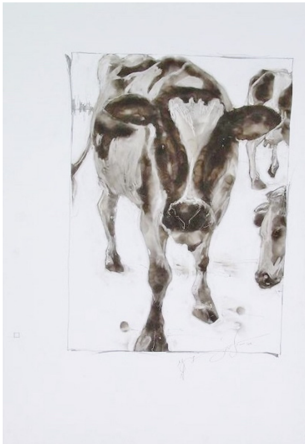
Like Pearls (2005), fumagine e acrilico su cartone, cm 70x100