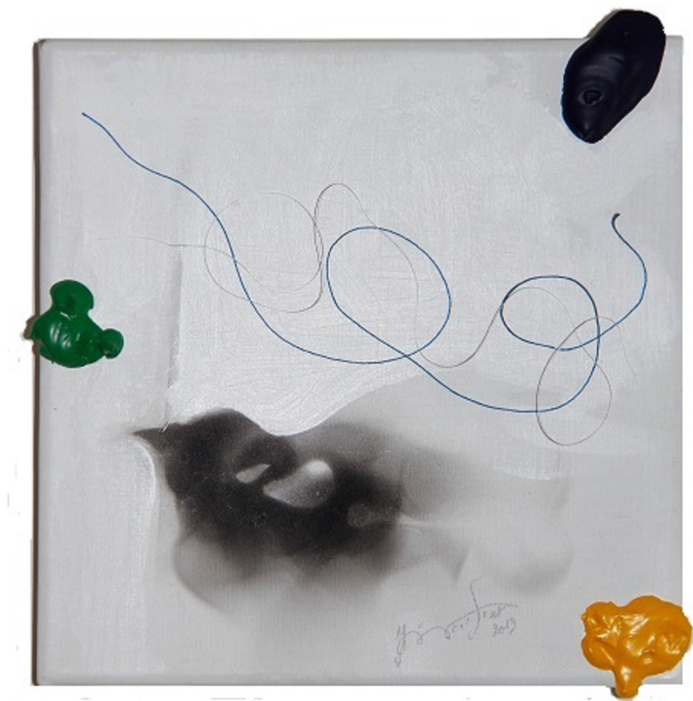
Remembering Birds (2013), fumagine, acrilico, filo e DNA (capelli), cm 20x20