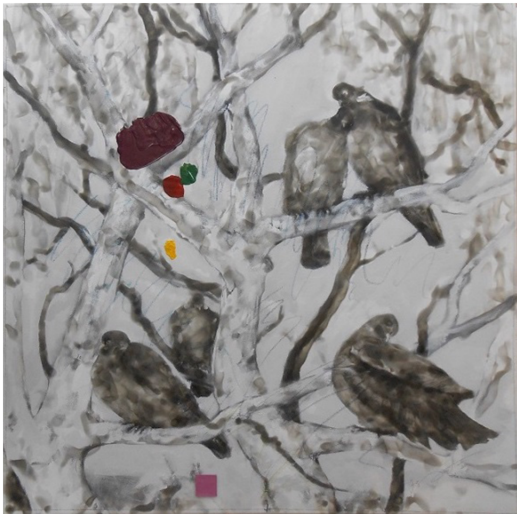
My Habitat (Noart). Reste haut du cœur (2016), fumagine e acrilico su tela, cm 100x100