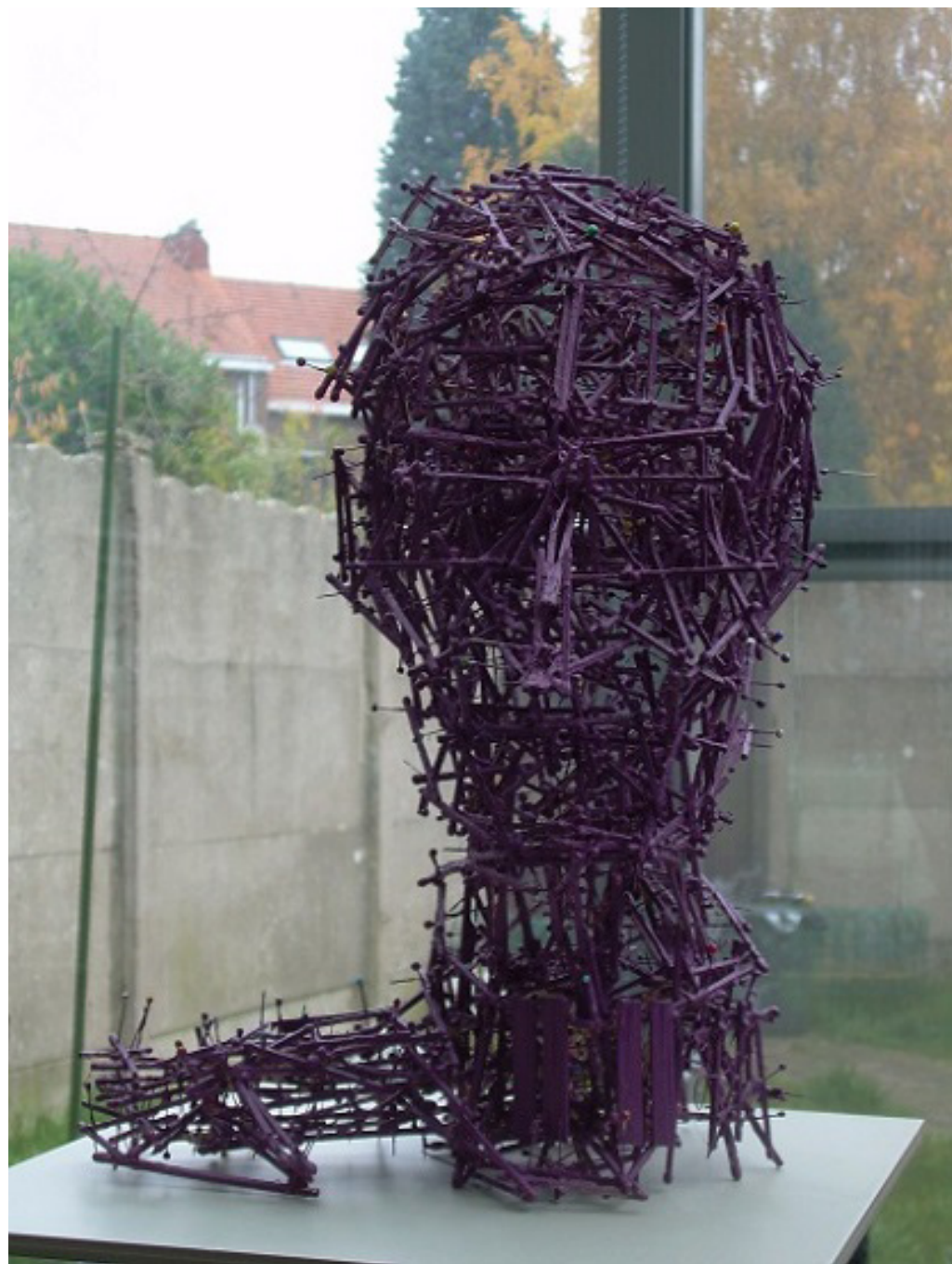
Koning Filip (Re Filippo) (2013), vernice, fiammiferi, cm 24x22x34