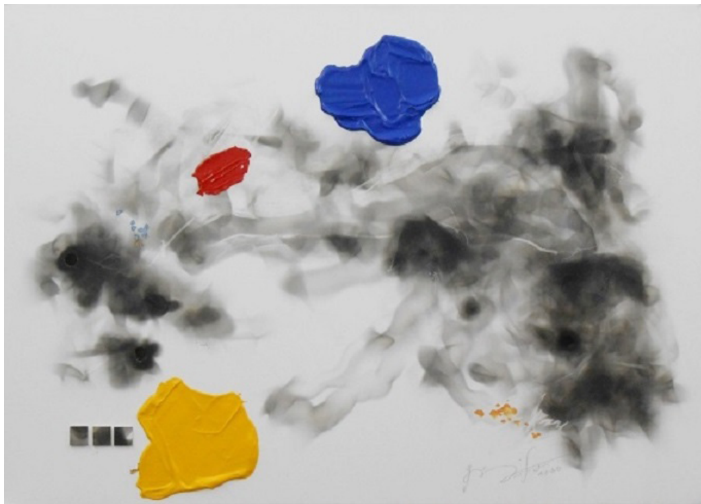
A Hole for a Camera, Hi, You There? (2014), fumagine e acrilico su tela, cm 70x50